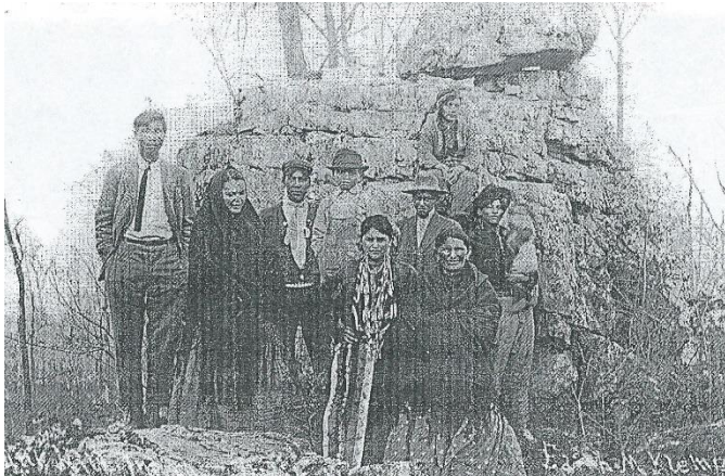
Residents and visitors at Skunk Hill rock formations.

In 1830 as a federal policy, President Andrew Jackson authorized the removal of all Native Americans from east of the Mississippi River, including the Menominee, Potawatomi, and Winnebago of the Wisconsin Territory. The policy led to a number of “governmental removal actions”, often including federal troop enforcement and Indian ‘death walks’, which continued into the 1850s. Most of the Potawatomi bands of central Wisconsin (esp. Dodge, Portage, Wood, and Shawano counties) were rounded up and moved into a reservation in Kansas. Although the tribes ceded their land by treaty, not all the bands within the tribal nations agreed with and accepted that loss of their homeland. Even in the 1860s, some were still “straying or wandering” bands in central Wisconsin, hunting and existing like nomads, while staying clear of the ‘settlement-growing- into- village activity’ of such settler sites as Stevens Point and Grand Rapids.