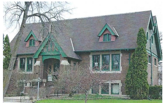
Aply serving the public of the Waupaca area as a free library for a century.

The Waupaca Historical Society will celebrate the 100 th anniversary of Waupaca's Carnegie Library Building on Sunday, July 20 th . Waupaca's Free Public Library was first opened in 1914 after the city received a grant from the Andrew Carnegie Foundation. The Waupaca building was one of 60 Carnegie buildings erected in the State of Wisconsin in the early 1900's. The historic building served as the library from 1914 until 1992, when a new modern library was built on the City Square. From 1992 to 2000 the building was the site of "Carnegie's Café" and was privately owned. In 2001, the Waupaca Historical Society purchased the historic property at 321 S. Main Street and renamed it the Holly History & Genealogy Center. The Society will celebrate this historic landmark during its 100 th year with a special program on Sunday evening, July 20 th , at the Holly History Center. The building will be open for a public "Open House" from 5:30 p. m. to 6:30 p. m. At 6:30 p. m. a special program, with guest speaker Marie App, will be held in the Holly Center's lower level meeting room. The Open House and Program are free and open to the public. Waupaca Historical Society members are encouraged to attend. Cake, coffee, and refreshments will be served after the program.