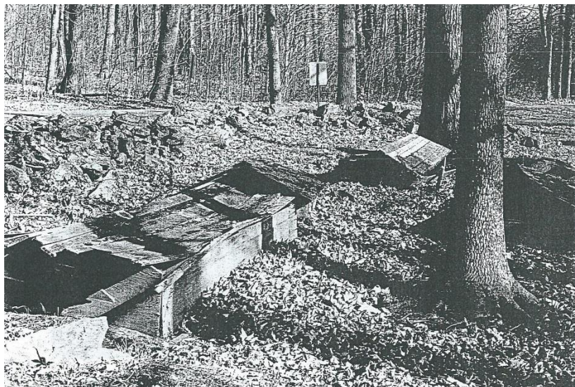
Log spirit houses over graves.

of which emphasized native world view and rejected American cultural values. The religion strove to continue traditional Indian beliefs and lifeways during a time when there was considerable pressure to assimilate.