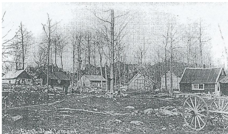
Powers Bluff Indian Village.